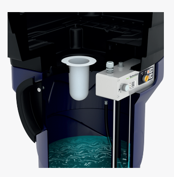
Filter socks 50µm

Electromechanical box can be dismantled without tools