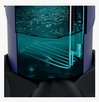
Heating time from 15 to 38°C in 15 min