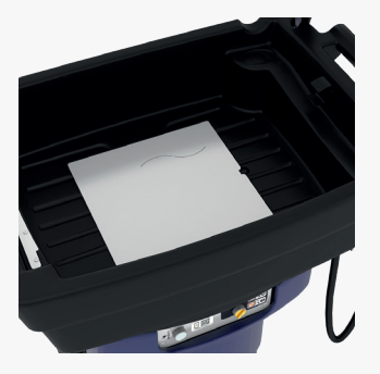
Ergonomic cleaning table